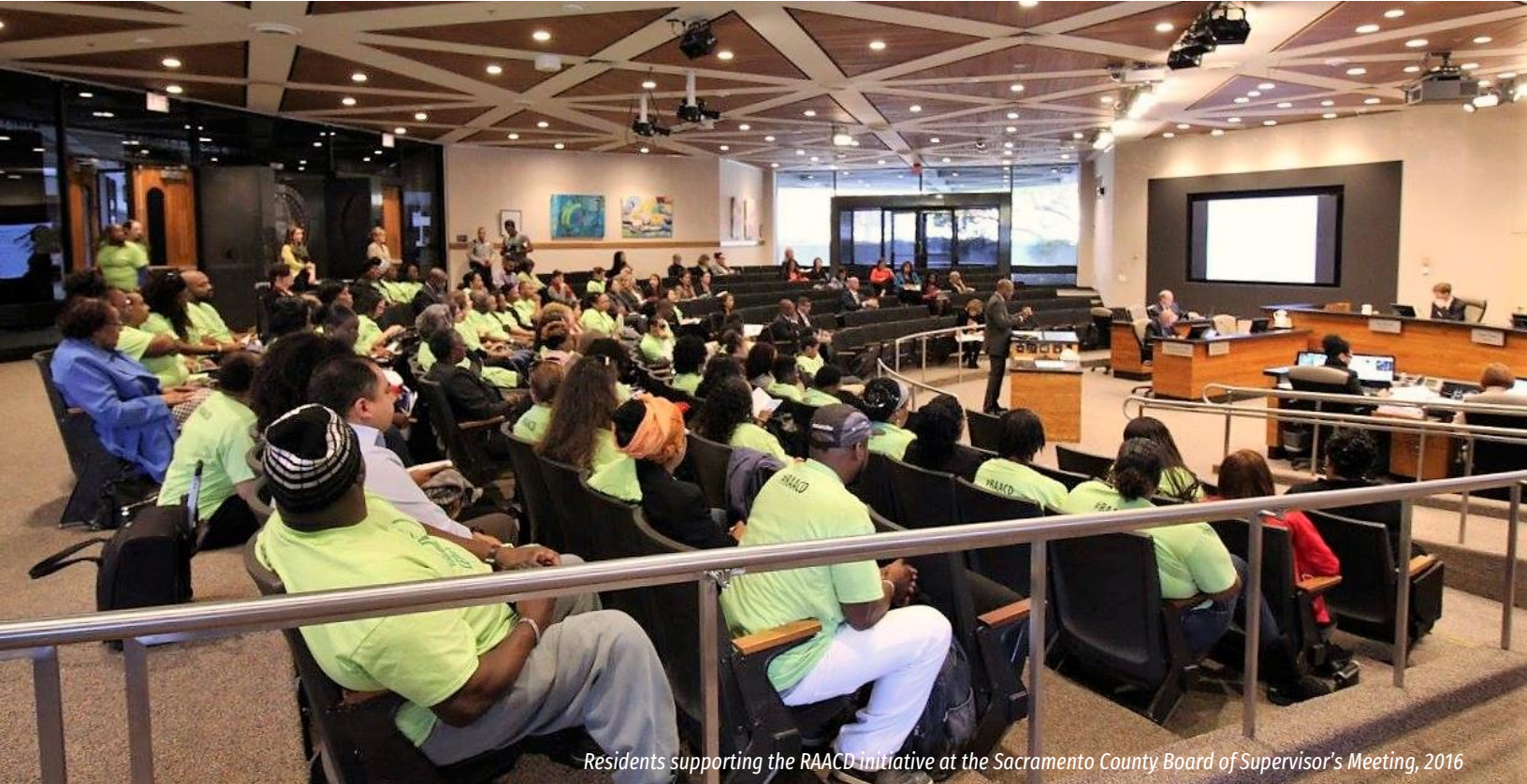
Residents supporting the RAACD initiative at the Sacramento County Board of Supervisor's Meeting, 2016