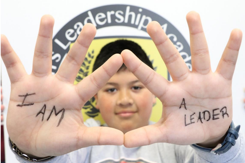
Pacific Elementary School MLA student showing off his “I AM...” statement

...we teach our students to be scholars of advocacy, to be change agents for the school system, to salvage dreams and save lives. We focus on empowering them, not just through grades but experiences they have had. ... We give them access to adult advocates ... so every student has an adult they know they can count on. We tie them into their own schools, as well as to their communities.