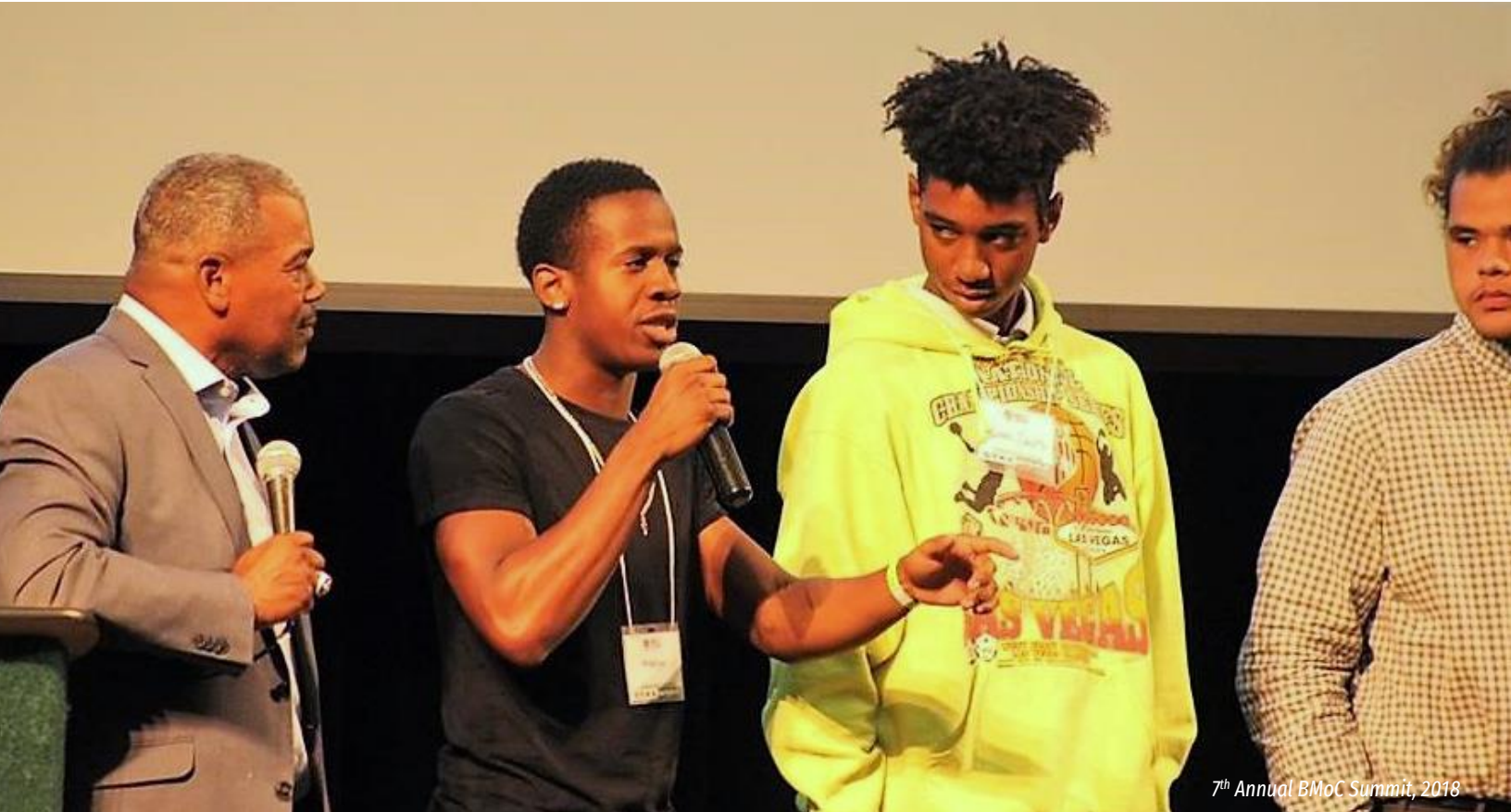
7 th Annual BMoC Summit, 2018