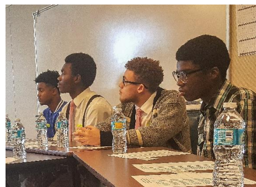
MLA youth sharing their school experiences as students of color with the State Superintendent and California Department of Education staff

This is particularly true for SCUSD, which suspends more Black males (in number and percentage) than any other school district in the state and has the second highest number of overall suspensions, 41 despite being the 13 th largest school district in the state. 42 In addition, racist incidences at SCUSD schools have been reported and include: (a) in February 2018 when a student in a SCUSD magnet program submitted a project for a science fair that concluded: “the lower average IQs of Blacks, Southeast Asians, and non-white Hispanics means that they are not as likely as non-Hispanic whites and Northeast Asians to be accepted into a more academically rigorous program such as Humanities and International Studies Program (HISP); therefore, the racial disproportionality of HISP is justified” 43 ; and (b) two high school students that posted a video with racist slurs to Instagram 44 . This racist antagonism at SCUSD schools coupled with the alarming district suspension statistics is proof that the district still has work to do to create a positive school climate and address inequality that is propagated by outdated school discipline policies and practices.