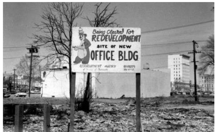
A former site in Japantown and a future site of an office building on Capitol Mall c. 1958.