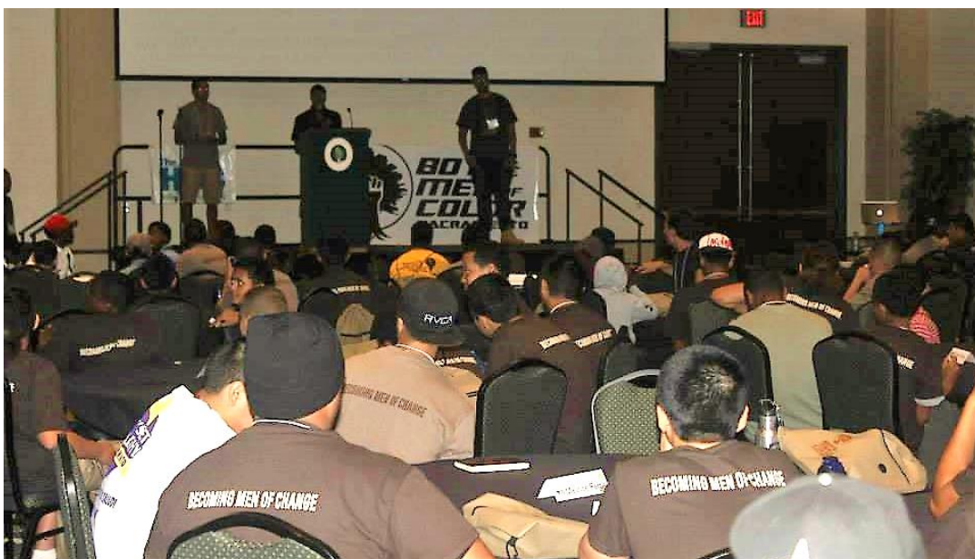
3 rd Annual BMoC Summit, 2014

The BMoC Summit is an example of what youth can accomplish when given the trust, encouragement and space necessary to realize and exercise their leadership skills.