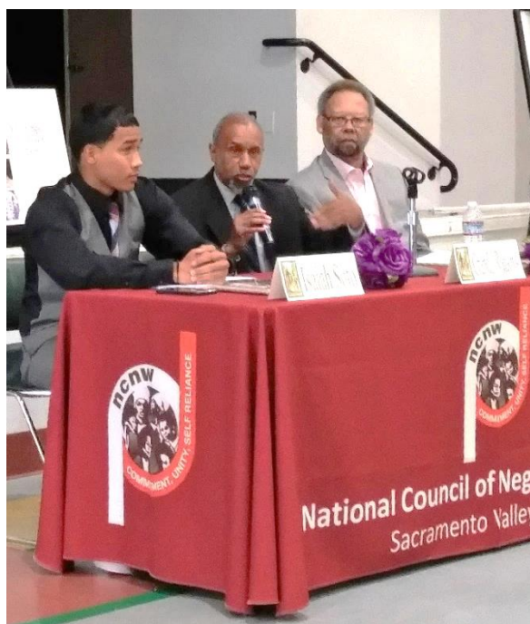
Zero Tolerance youth and adult allies