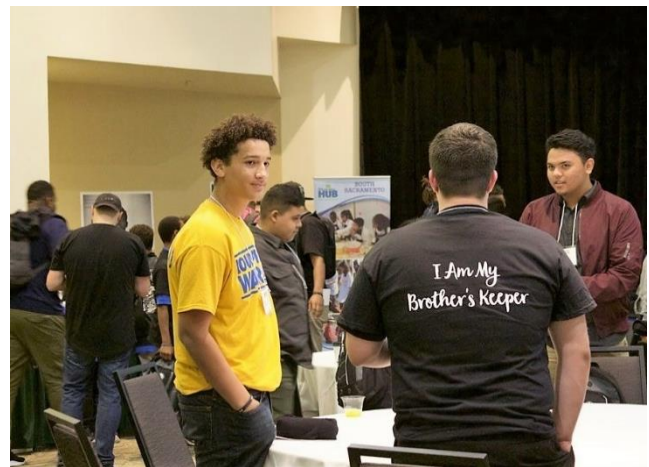
Youth attending 6 th Annual BMoC Summit, 2017

While the Sacramento BMoC Collaborative focused on issues facing boys and young men of color locally, statewide and national efforts increased as well. In 2014, President Obama launched the My Brother's Keeper (MBK) , to address persistent opportunity gaps facing boys and young men of color. MBK included a community challenge for cities, Tribal Nations, towns and counties to create and implement plans to ensure all young people can achieve their full potential. 17 In response to the challenge, then City of Sacramento Mayor Kevin Johnson led the creation of a regional My Brother's Keeper initiative in Sacramento with funding from the Sacramento BHC and the Sierra Health Foundation.