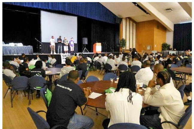
1 st Annual BMoC Summit, 2012

The Sacramento BMoC Collaborative included organizations involved in youth leadership development, trauma-informed care, and school discipline policy work. 14 The BMoC members met regularly to discuss the direction and purpose of the collaborative, as well as strengthen the working relationships of collaborative members. From the outset, collaborative members knew that the voices of boys and young men of color was essential for guiding the work. To solicit youth voice, the collaborative decided to organize a Boys and Men of Color Summit, which is described further in a subsequent section . K. Williams relayed that, "as we were building a BMoC Collaborative, those [summit break out session discussion themes] were going to be the issues" the BMoC Collaborative would focus on.