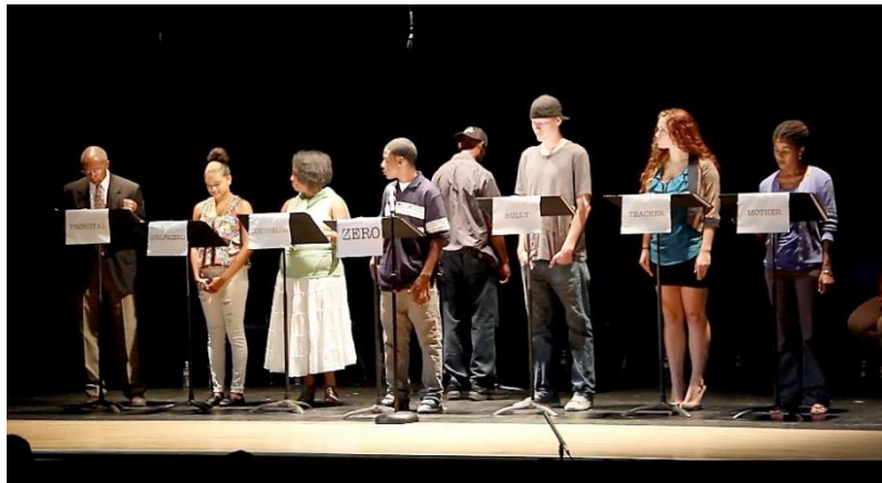
Production still from the play Zero, 2012