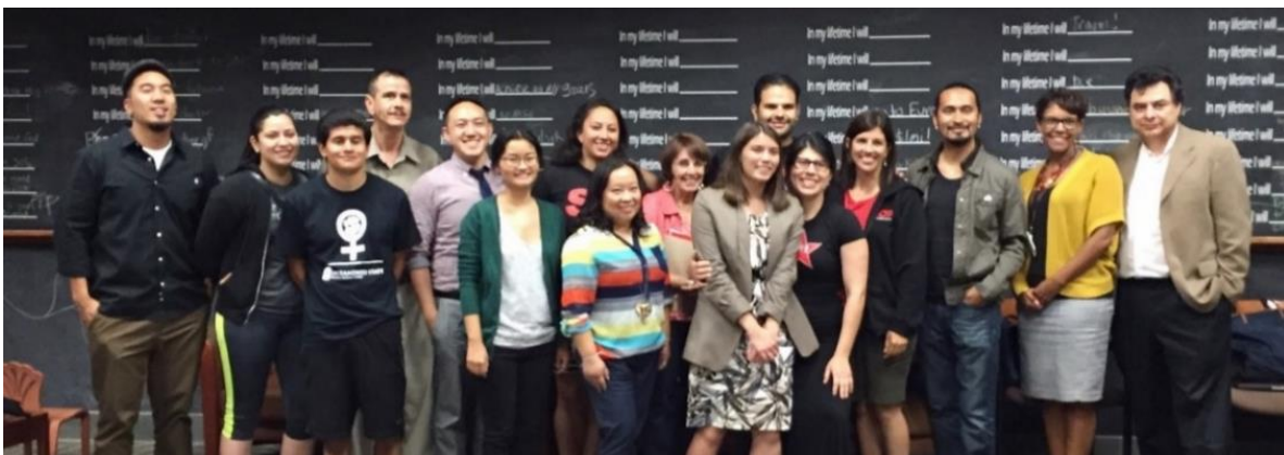
Sacramento's Ethnic Studies Now Coalition upon SCUSD's approval of Resolution 2845 "Ethnic Studies Resolution", 2015

Sacramento BHC grantee HIP is an active member of ESNC who continue to monitor implementation of the SCUSD initiative. Based on the success of the SCUSD initiative, the ESNC is expanding their efforts to other Sacramento County school districts and has launched a campaign advocating for Elk Grove Unified School District to add ethnic studies as a high school graduation requirement.