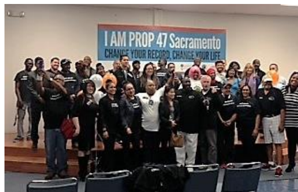
Community leaders celebrate the anniversary of Prop 47, 2015

The Sacramento Reinvestment Coalition formed in 2016, with the aim to advocate for increased resources for crime prevention and intervention while supporting the implementation of police reform and violence reduction strategies, like the Advance Peace program described previously. The Sacramento Reinvestment Coalition is convened by BHC-grantee, Sacramento ACT, and has its roots in the “I Am Prop 47 Sacramento” Coalition that advocated for the passing of California Proposition 47 to reclassify six low-level felonies as misdemeanors. Proposition 47 passed on November 4, 2014 and the I Am Prop 47 Coalition members worked with the formally incarcerated community members to reclassify their felony offenses as misdemeanors or to expunge their criminal records.