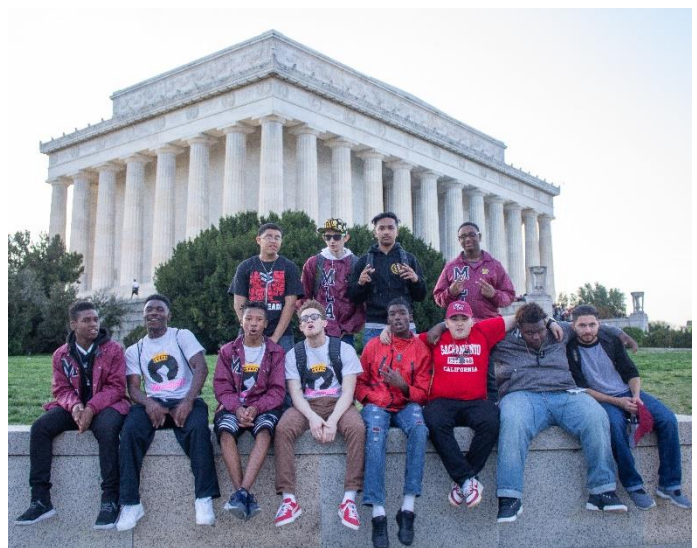
MLA students visiting the Lincoln Memorial, Washington D.C.