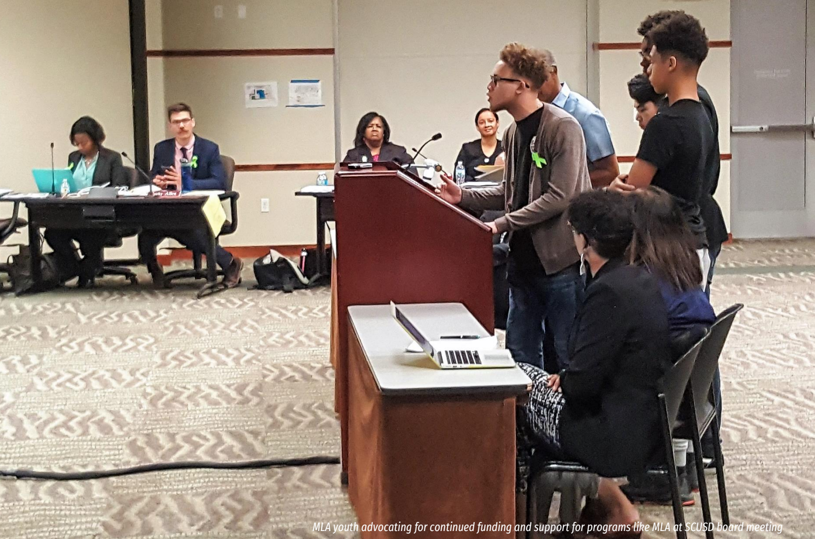
MLA youth advocating for continued funding and support for programs like MLA at SCUSD board meeting