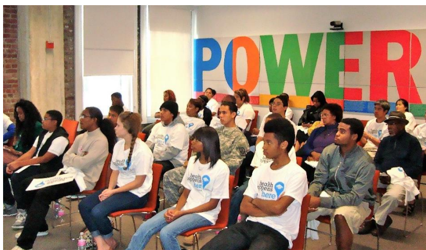
Sacramento youth attending the Virtual Rally, October 2011

and raise awareness about the magnitude of the school discipline policy issue, BPSB was asked to mobilize Sacramento youth for the rally. At the rally, a youth with the BPSB recounted how strictly enforced school discipline policies negatively affected one of her classmates: 33