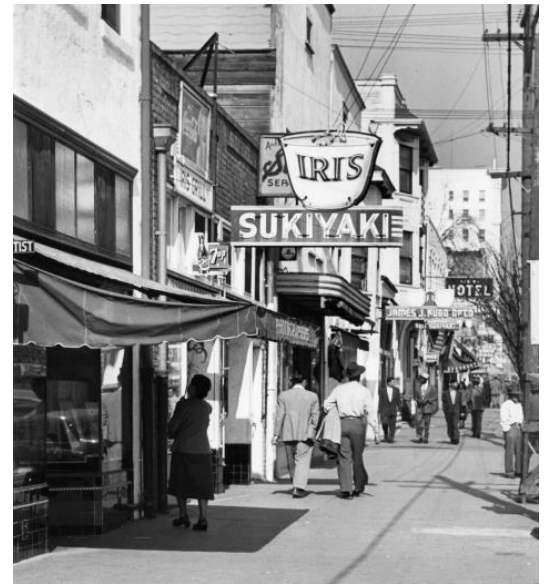
4 th Street Sacramento's Japantown, near Capitol Avenue c. 1949.

The City of Sacramento continues to draw immigrants from other countries. As Hmong, Laotian, Vietnamese, Afghan and Syrian war refugees, and immigrants from other countries move to the Sacramento area, they are largely settling in the communities that house the populations displaced by the redevelopment in the 1950s. The neighborhoods are vibrant cultural centers but continue to be plagued by economic disinvestment. The Sacramento BHC area encompasses many of the neighborhoods that did not have racial covenants and is therefore racially diverse and culturally vibrant. However, the history of racial covenants has also led to the Sacramento BHC area having economic and social conditions that are indicative of poor health, which led to TCE selecting the community as one of the 14 BHC sites. How boys and men of color became a focus for TCE and Sacramento is detailed in the subsequent section.